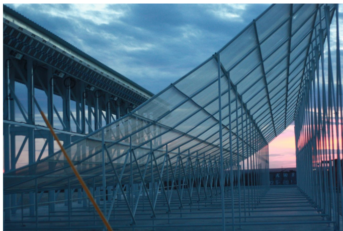
LeoLab radar in Midland, TX.

There are also many amateur satellite observers around the globe that use telescopes, binoculars, and other equipment to track satellites. Some amateurs have the capability to image satellites or detect radiofrequency transmissions. 14 Although they are only loosely organized through the Internet, the amateur observing community presents a non-trivial SSA capability. In particular, they have demonstrated the ability to routinely track classified national security payloads from several countries, including the U.S. military's secretive X-37B. 15 The Defense Advanced Research Projects Agency (DARPA) has experimented with combining data from some amateur observers, along with academic and civil institutions, to improve existing SSA capabilities. 16